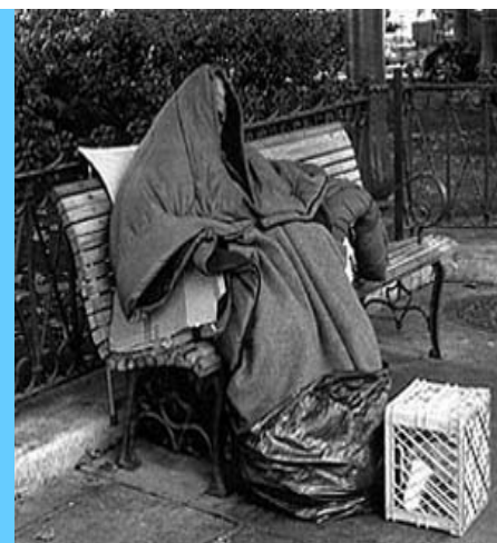
He says “THANK YOU”

Address: 22, Clarence Road Long Eaton, Nottingham. NG10 3NQ Phone: 0115 9464903 Fax: 0115 9734103 Email: info@canaan-trust.co.uk